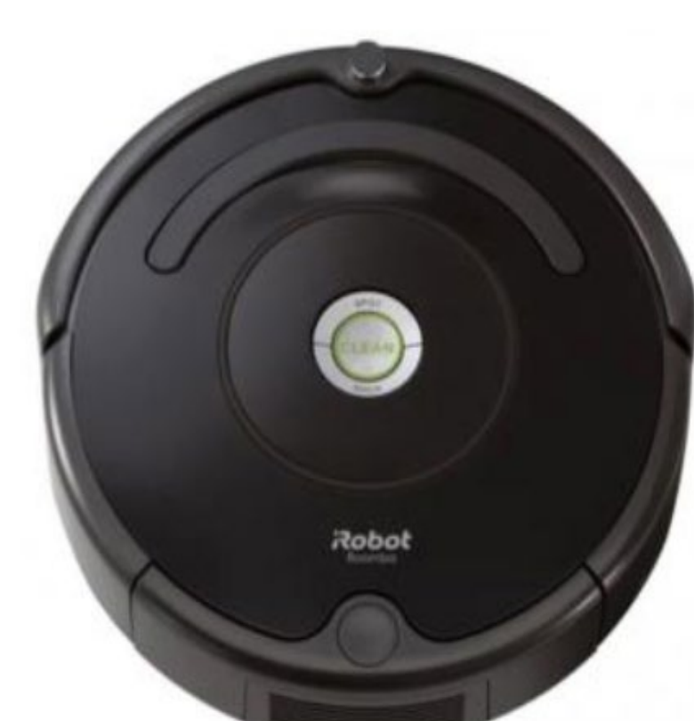
Roomba by iRobot

Amazon Echo is a smart speaker that connects to the voice-mediated assistant, “Alexa”. Features of this device includes: voice interaction, music playback, creation of to-do lists, setting alarms, streaming podcasts, providing weather, traffic, and real-time information, and controlling other home smart devices.