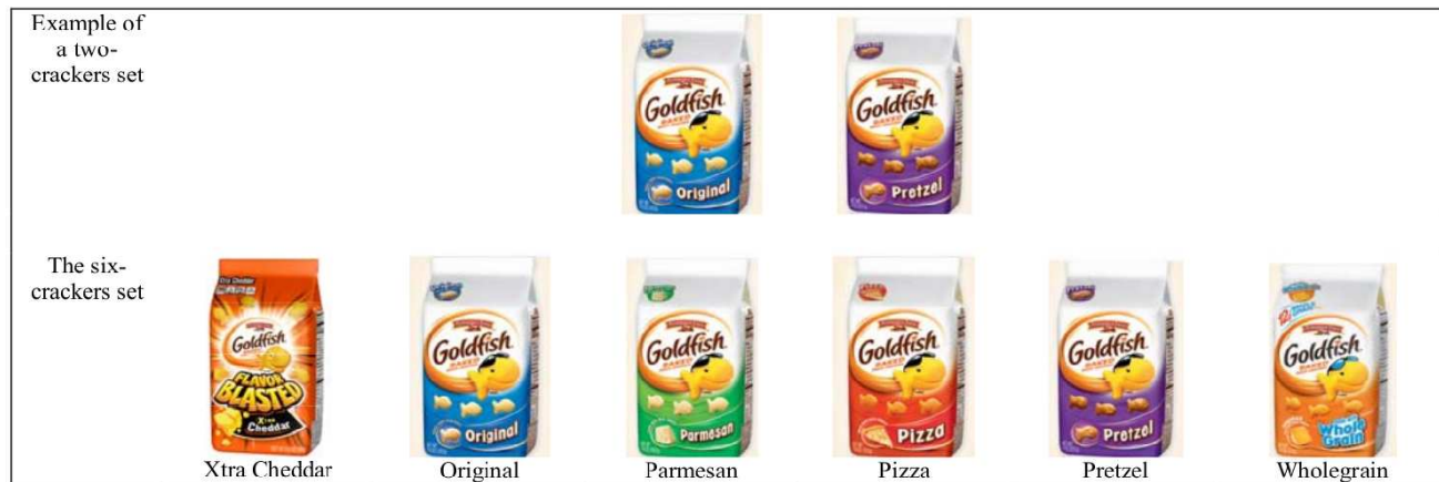
Figure 3: Choice sets used in Study 3.