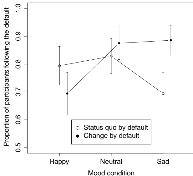
Figure 3: Proportion of participants following the default by type of default and mood condition. Error bars represent standard errors of the mean.

Participants in the happy condition were more excited than participants in the neutral condition ( p = .004 ), but did not differ from them in their ratings of anger and curiosity. There were no differences in how jittery participants felt. Mean and standard deviations of all affect measures can be found in the Appendix.