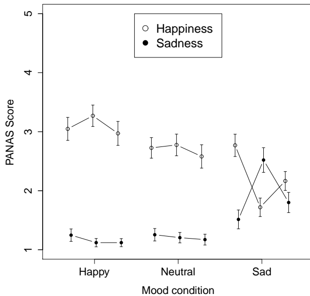
Figure 2: Level of happiness and sadness for each mood condition and for each of the three measurement time points: at the beginning of the experiment, after the mood induction and at the end of the experiment. Error bars represent standard errors of the mean.